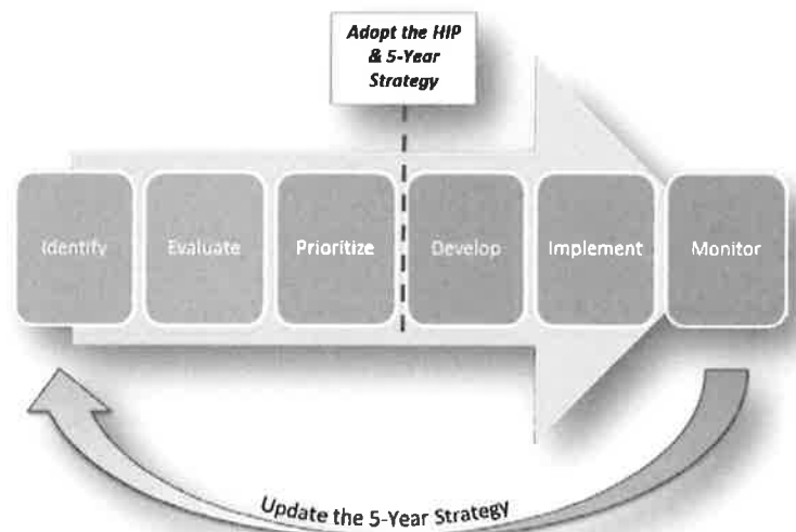
Figure 1 Housing Implementation Cycle

The Central Point HIP prioritizes actions or programs that fall within one of four categories (i.e. regulatory reforms, affordable housing incentives, affordable housing funding, and monitoring). Figure 1 illustrates the planning process for development of the City’s HIP as a continuous cycle that aims to implement actions and programs that will advance the goal of increasing housing supply and affordability. Through program monitoring it will be possible to better understand of how well the program achieves