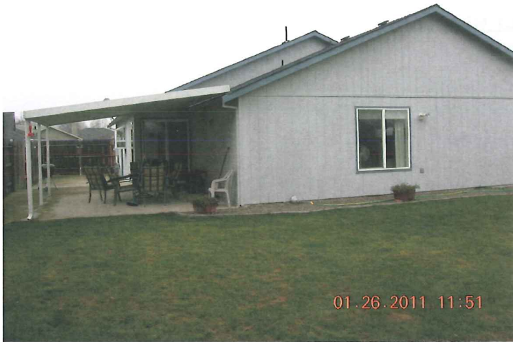
EASTERLY & SOUTHERLY FACE OF HOME