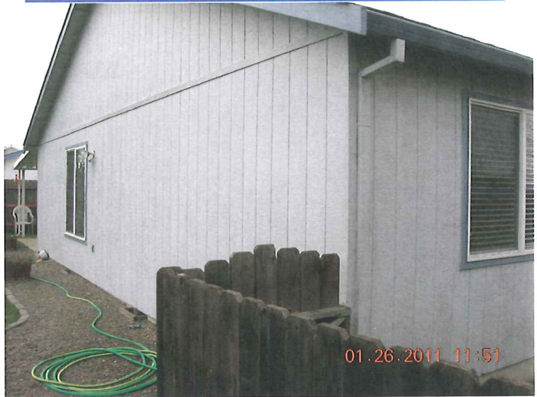
EASTERLY FACE OF HOME (LOOKING SOUTHERLY)