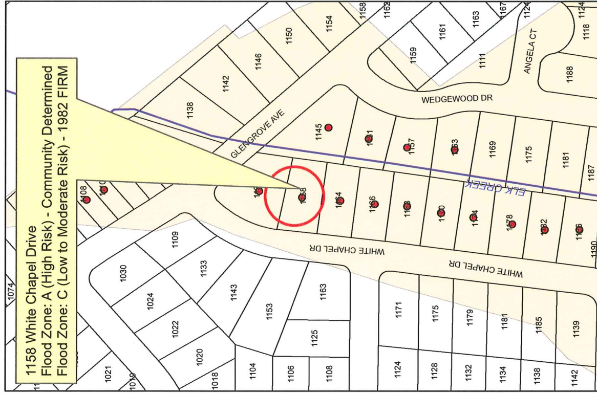
Existing Flood Map (1982)