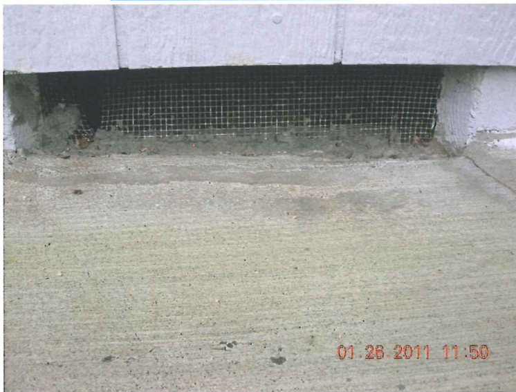
TYPICAL FOUNDATION VENT