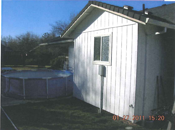
SOUTHERLY FACE OF HOME (LOOKING WESTERLY)