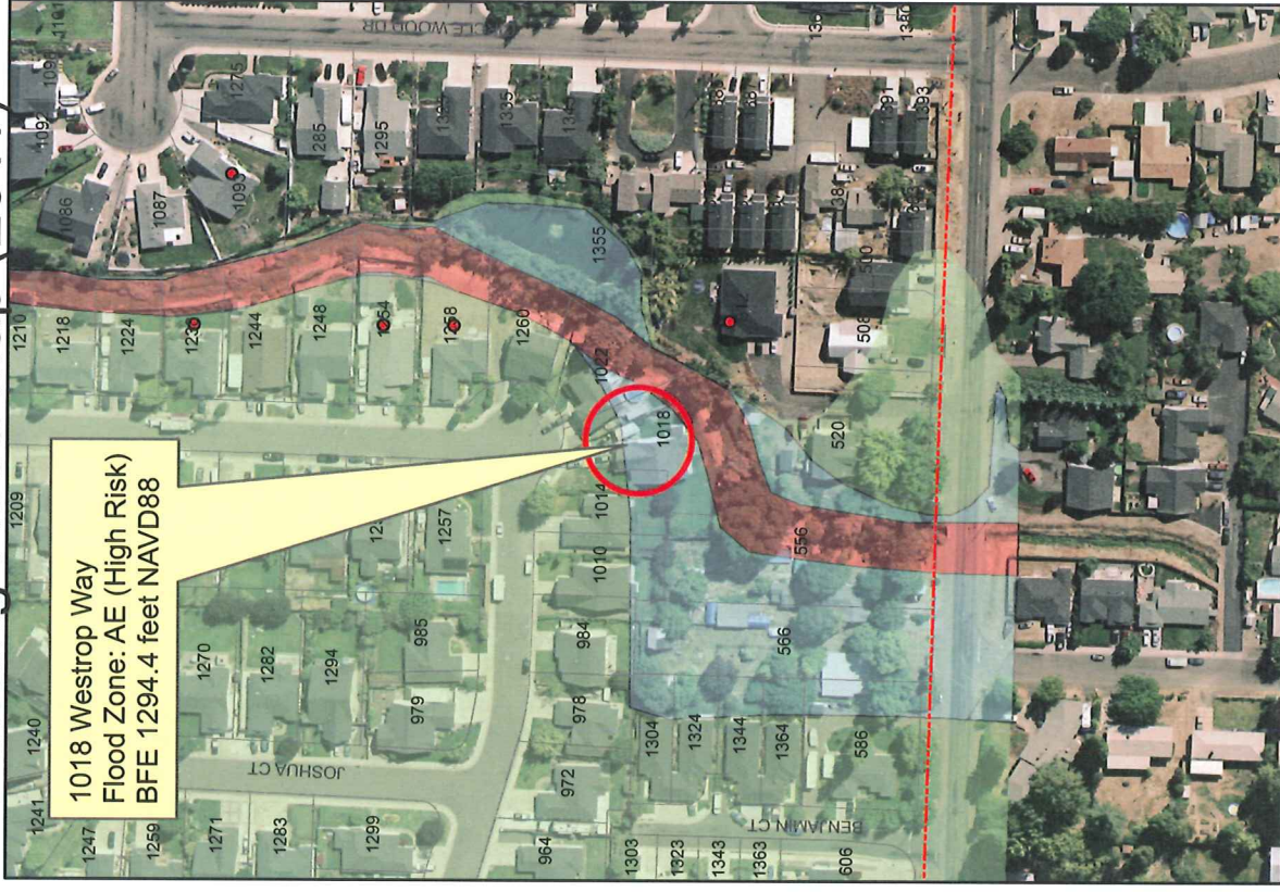
Pending Flood Map (2011)