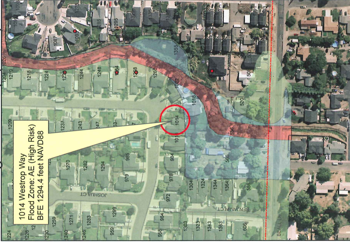
Pending Flood Map (2011)