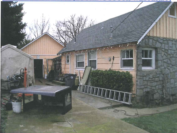
EAST FACE OF HOME (LOOKING SOUTH WESTERLY)