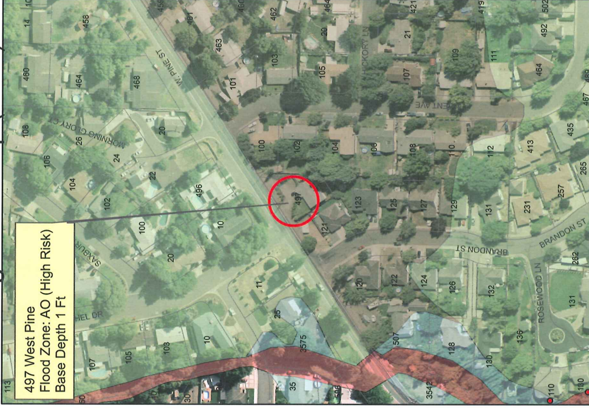
Pending Flood Map (2011)