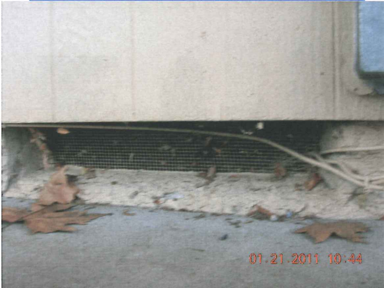
FOUNDATION VENT WITH HARDWARE CLOTH (8)