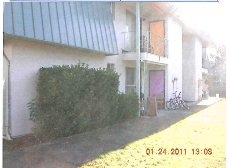
WEST FACE OF BUILDING (LOOKING SOUTHERLY)