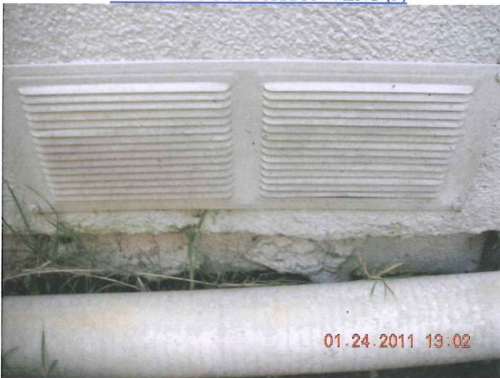
TYPICAL FOUNDATION VENT (9)