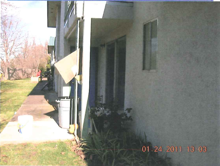
WEST FACE OF BUILDING (LOOKING NORTHERLY)