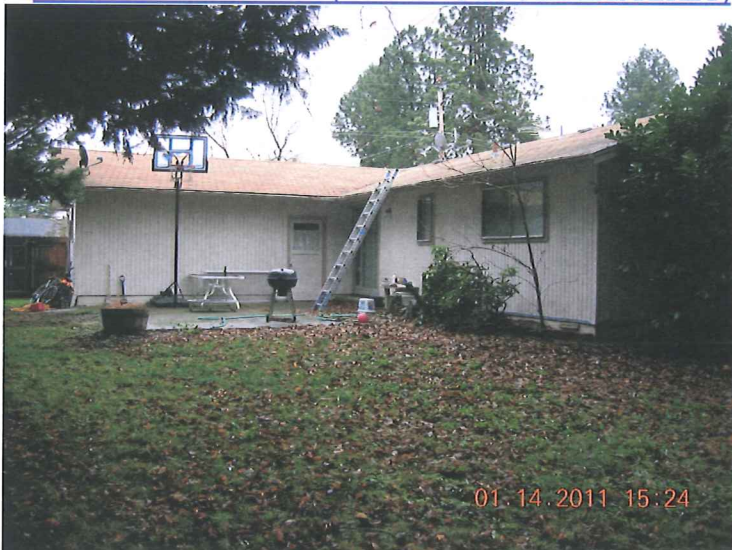
WEST FACE OF HOME (LOOKING SOUTH EASTERLY)