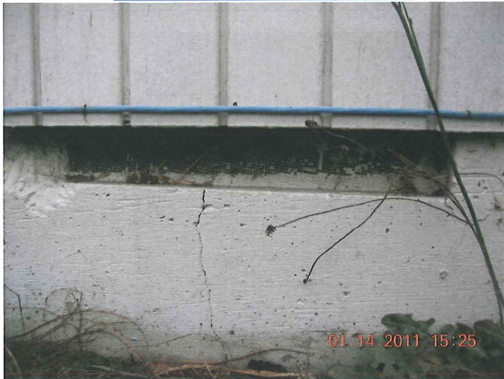
TYPICAL FOUNDATION VENT (9)