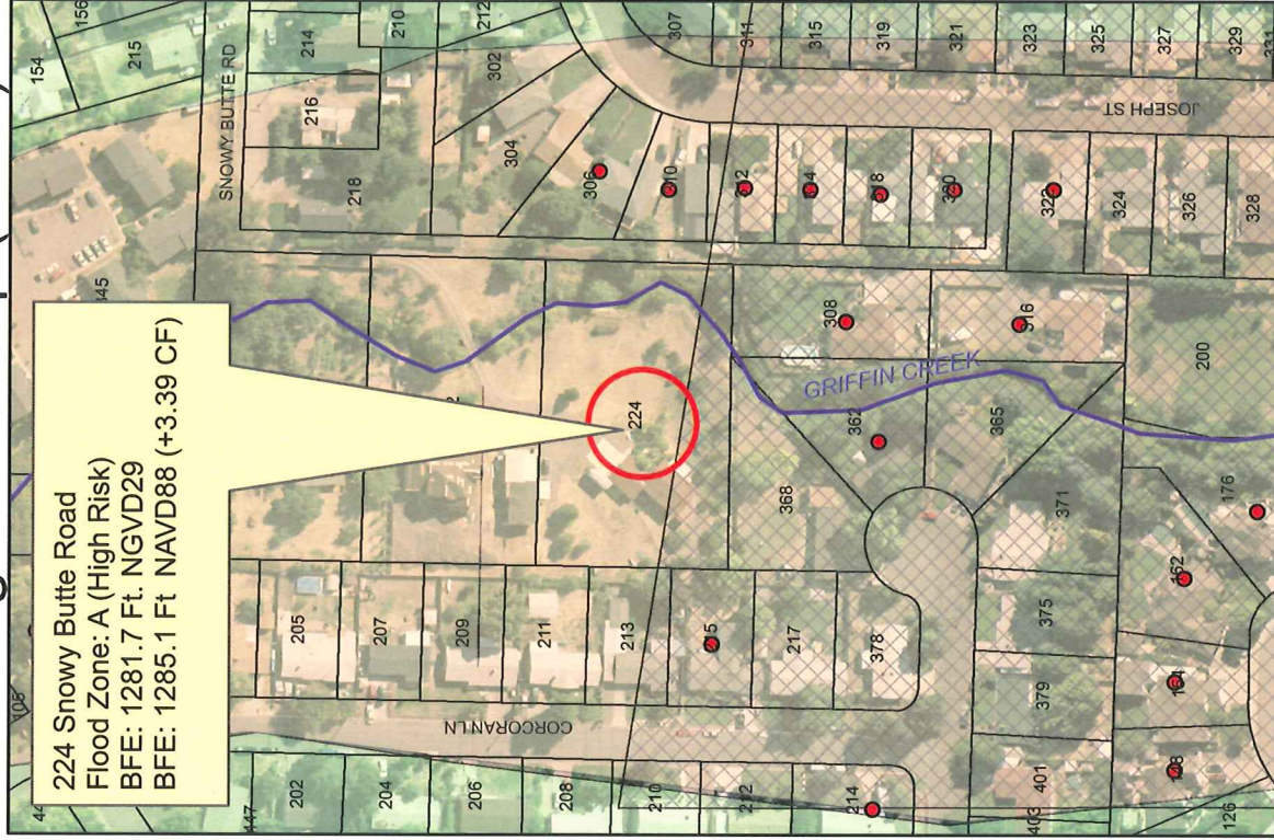
Existing Flood Map (1982)