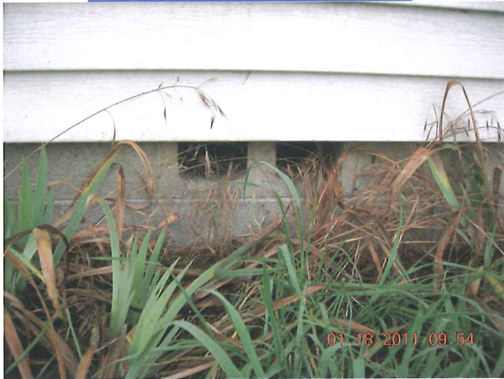
CMU BLOCK FOUNDATION VENT (9)