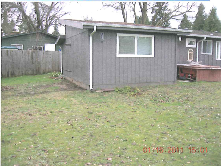
NORTHEAST CORNER (LOOKING SOUTH WESTERLY)