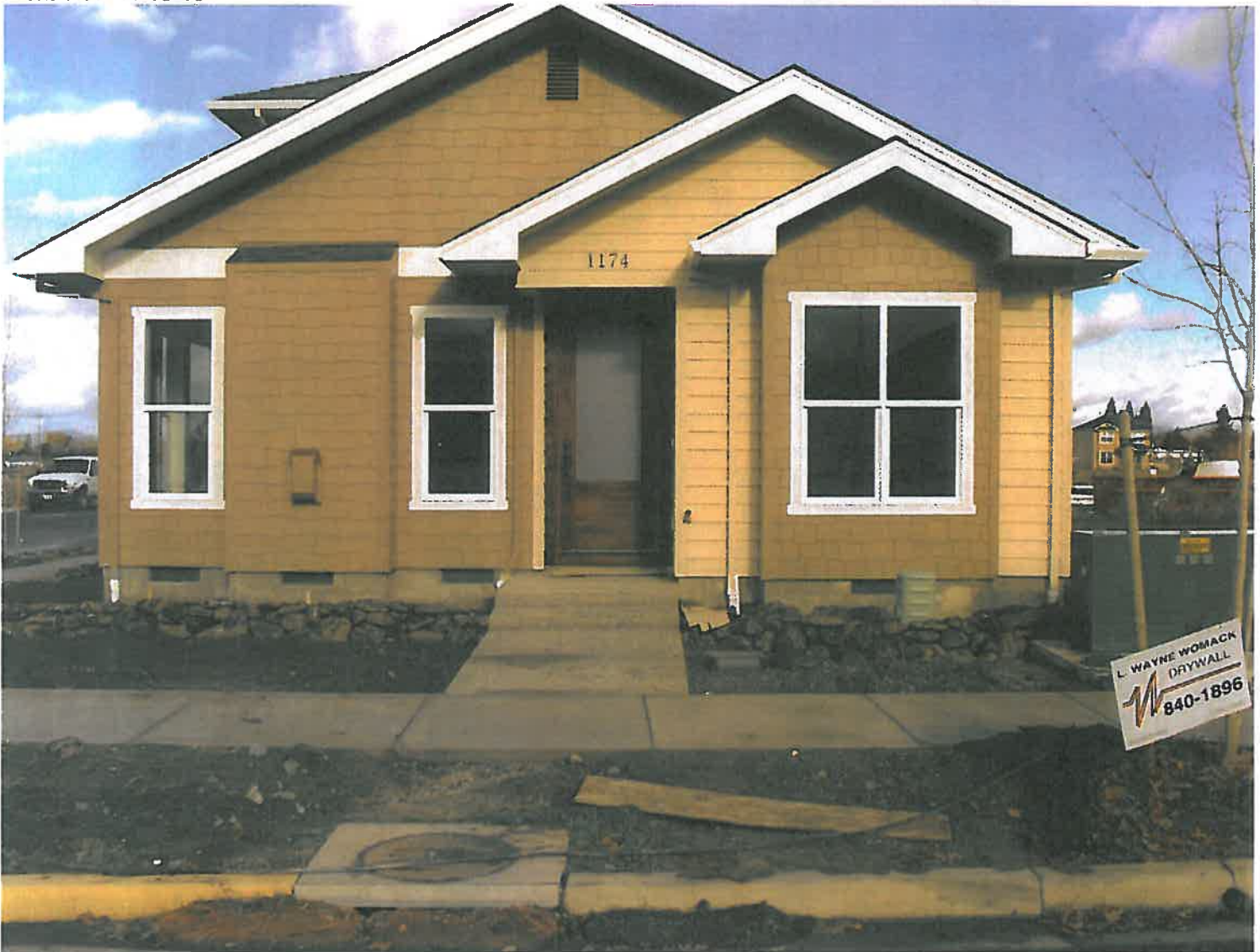
Front View 11-10-10