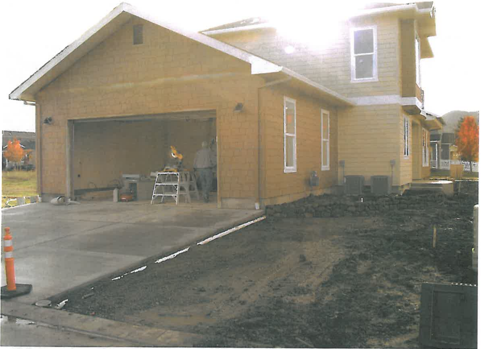
Rear View 11-10-10