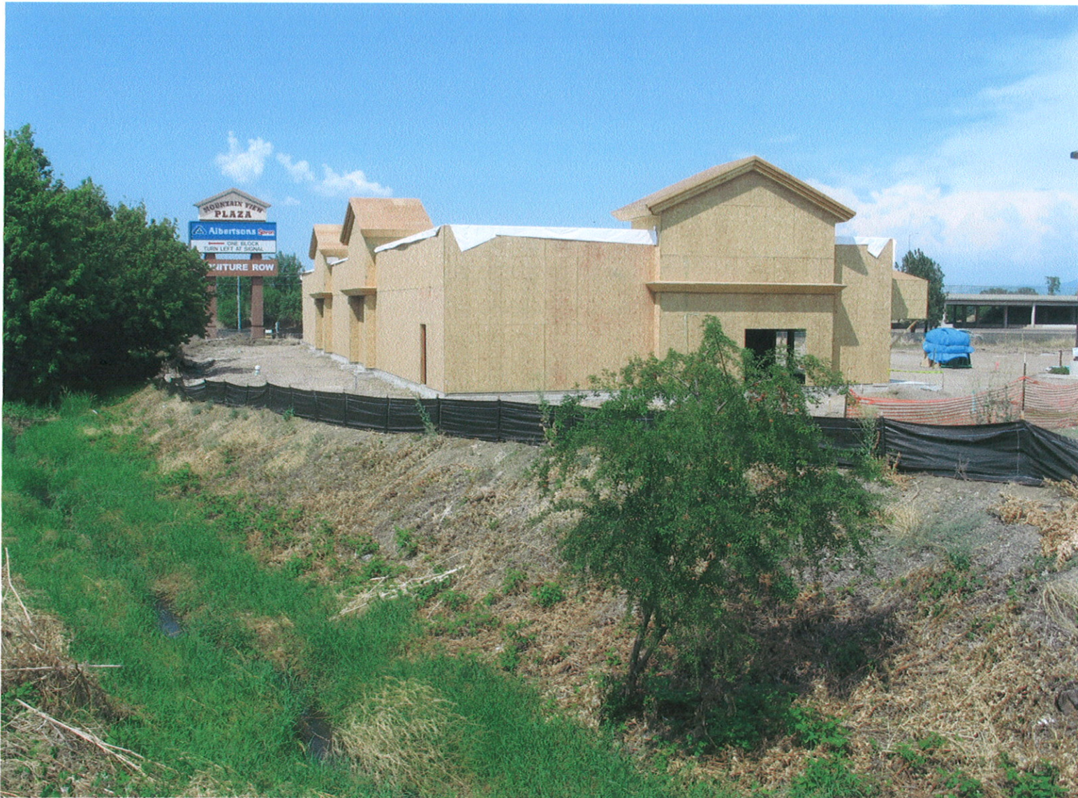
BACK-SOUTH SIDE (LEFT SIDE)-AND CREEK VIEW 7-23-2006