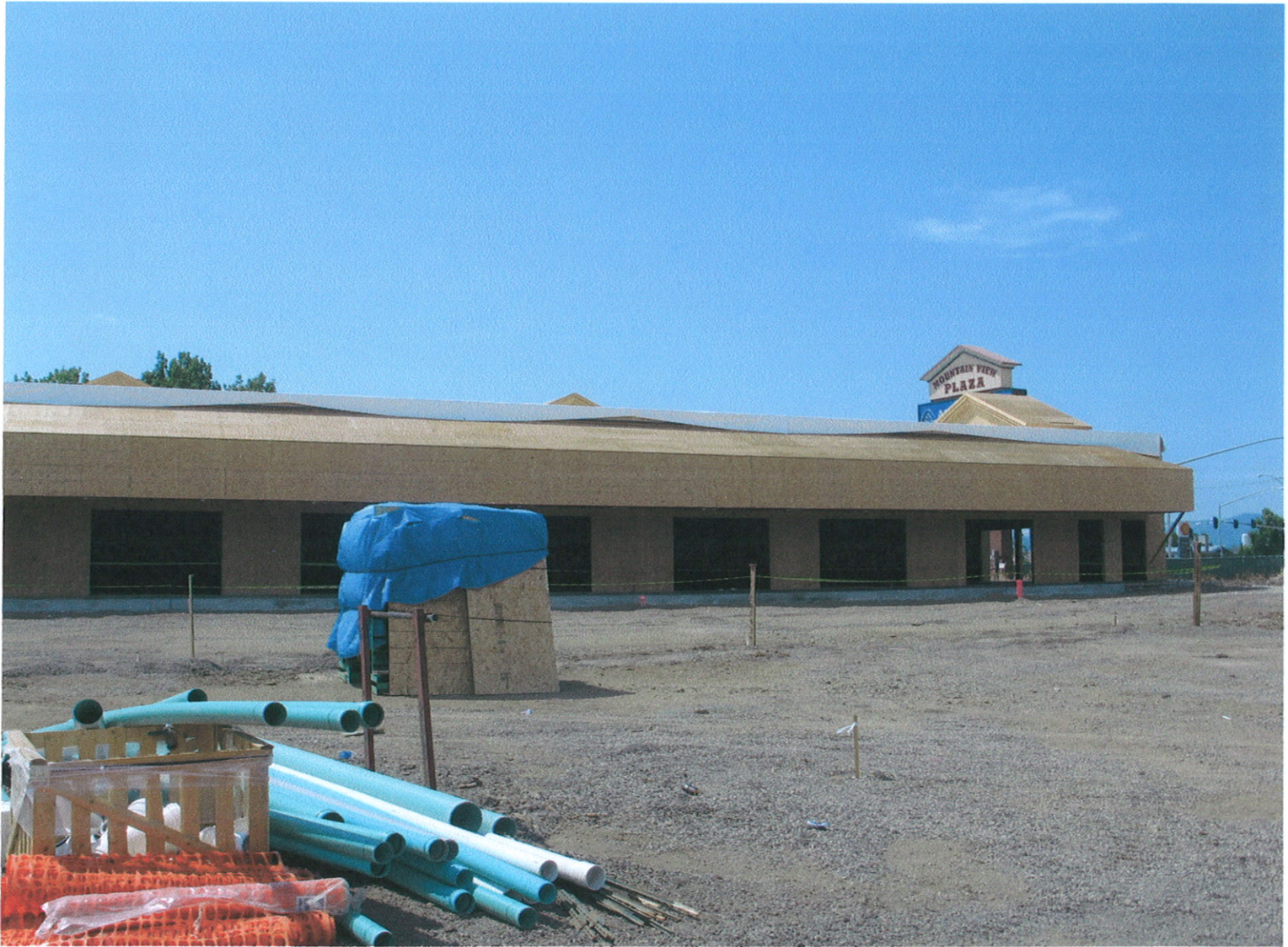
FRONT VIEW- 7-23-2006

If using the Elevation Certificate to obtain NFIP flood insurance, affix at least two building photographs below according to the instructions for Item A6. Identify all photographs with: date taken; "Front View" and "Rear View"; and, if required, "Right Side View" and "Left Side View." If submitting more photographs than will fit on this page, use the Continuation Page, following.