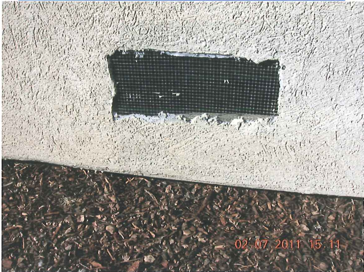
FOUNDATION VENT WITH HARDWARE CLOTH (11)