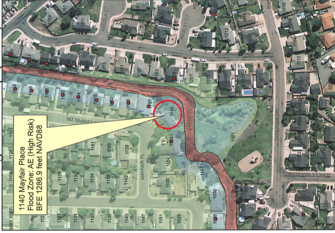
Pending Flood Map (2011)