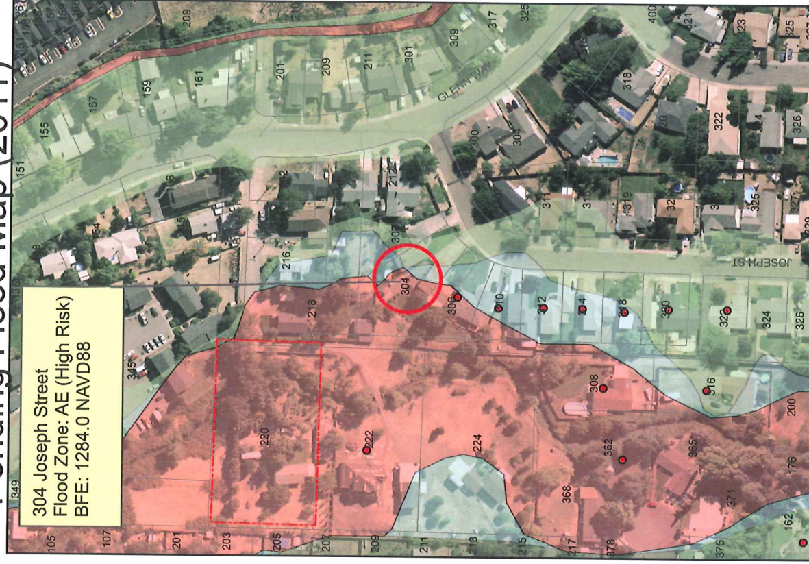
Pending Flood Map (2011)