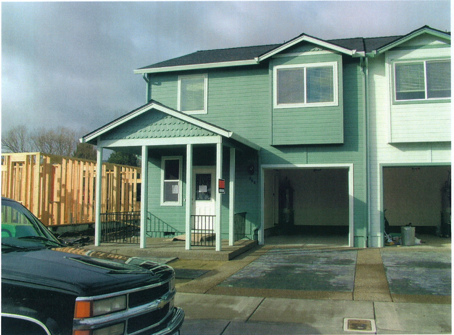
Date Taken 2/6/2008 – Front View

If using the Elevation Certificate to obtain NFIP flood insurance, affix at least two building photographs below according to the instructions for Item A6. Identify all photographs with: date taken; "Front View" and "Rear View"; and, if required, "Right Side View" and "Left Side View." If submitting more photographs than will fit on this page, use the Continuation Page, following.