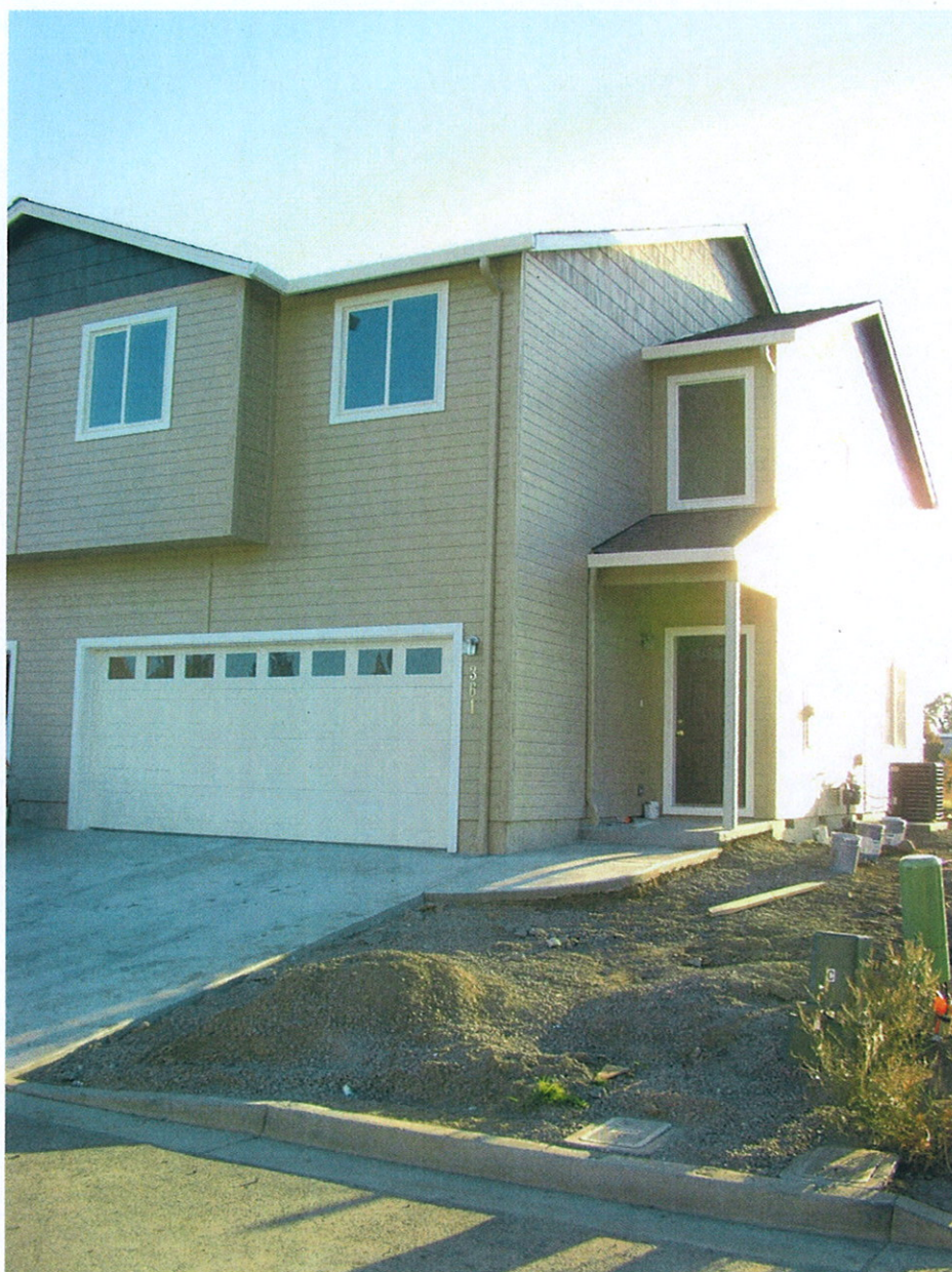
September 27, 2007 Front/Right View

If using the Elevation Certificate to obtain NFIP flood insurance, affix at least two building photographs below according to the instructions for Item A6. Identify all photographs with: date taken; "Front View" and "Rear View"; and, if required, "Right Side View" and "Left Side View." If submitting more photographs than will fit on this page, use the Continuation Page, following.