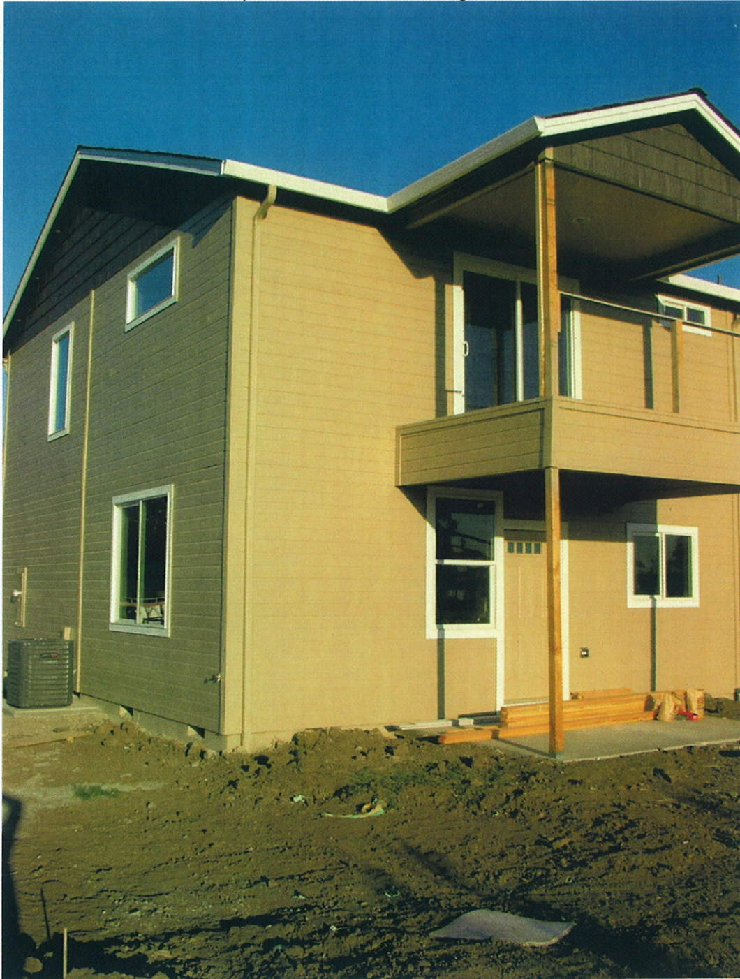
September 27, 2007 Rear/Right View