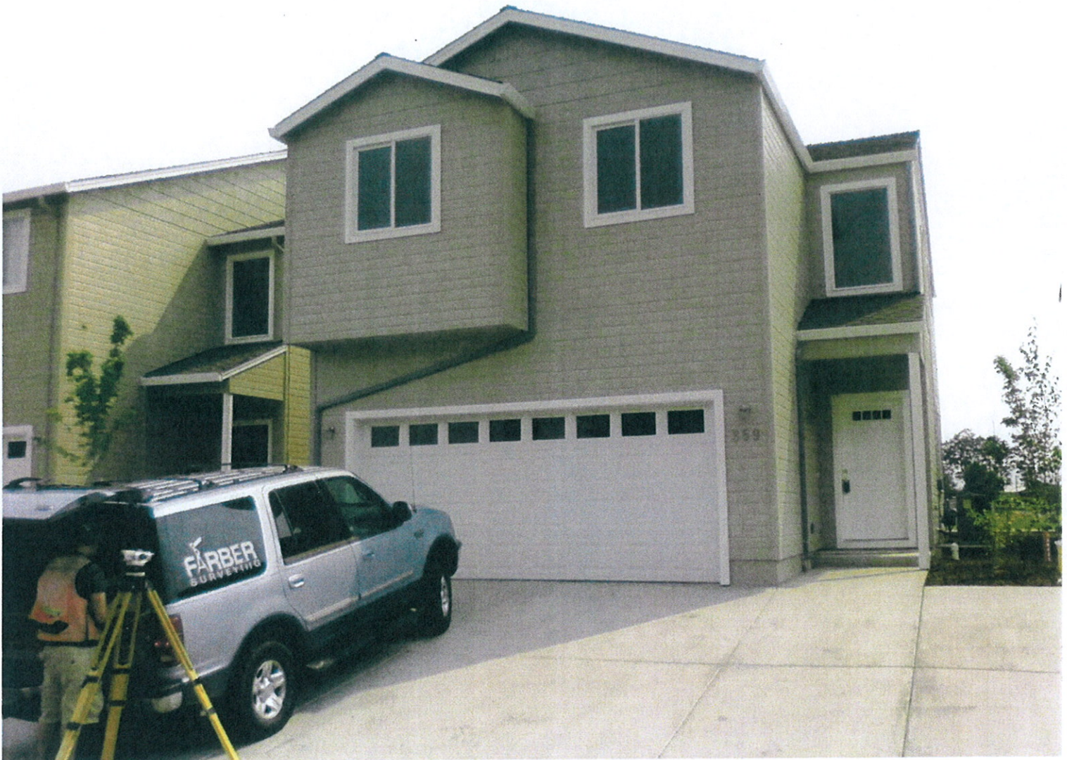
FRONT VIEW (8/8/2008)

If using the Elevation Certificate to obtain NFIP flood insurance, affix at least two building photographs below according to the instructions for Item A6. Identify all photographs with: date taken; "Front View" and "Rear View"; and, if required, "Right Side View" and "Left Side View." If submitting more photographs than will fit on this page, use the Continuation Page, following.