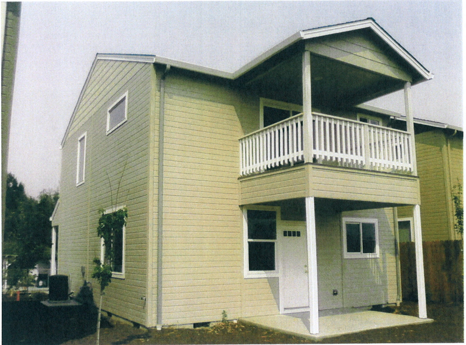
REAR/RIGHT SIDE VIEW (8/8/2008)