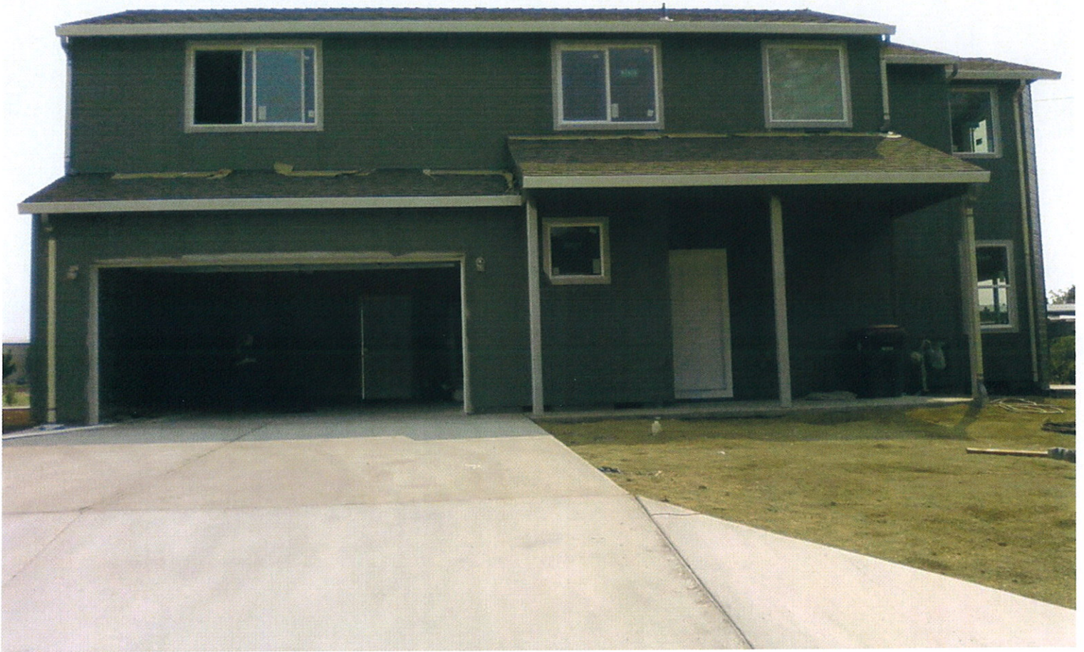
FRONT VIEW (8-8-2008)

If using the Elevation Certificate to obtain NFIP flood insurance, affix at least two building photographs below according to the instructions for Item A6. Identify all photographs with: date taken; "Front View" and "Rear View"; and, if required, "Right Side View" and "Left Side View." If submitting more photographs than will fit on this page, use the Continuation Page, following.