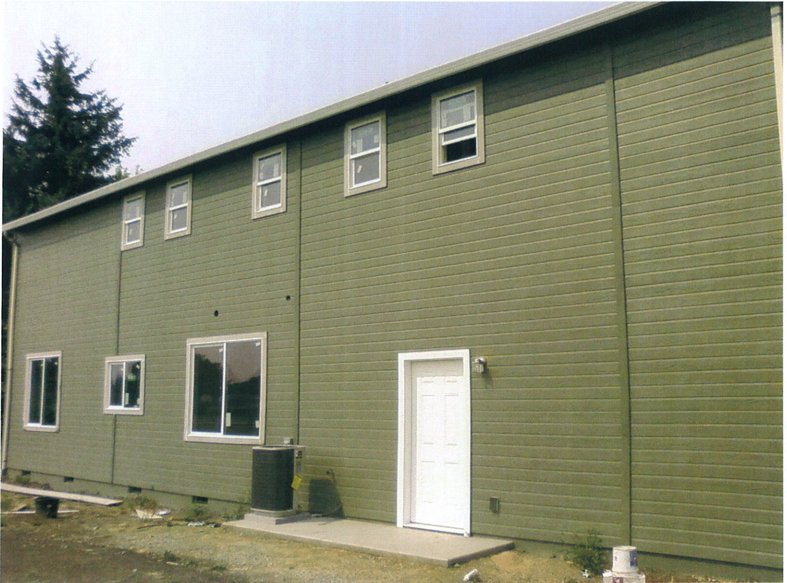
REAR VIEW (8-8-2008)