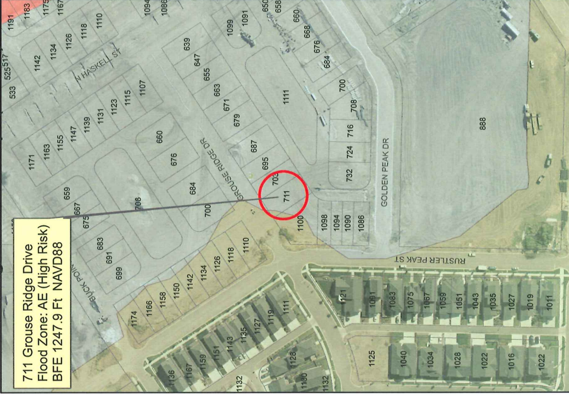
Pending Flood Map (2011)