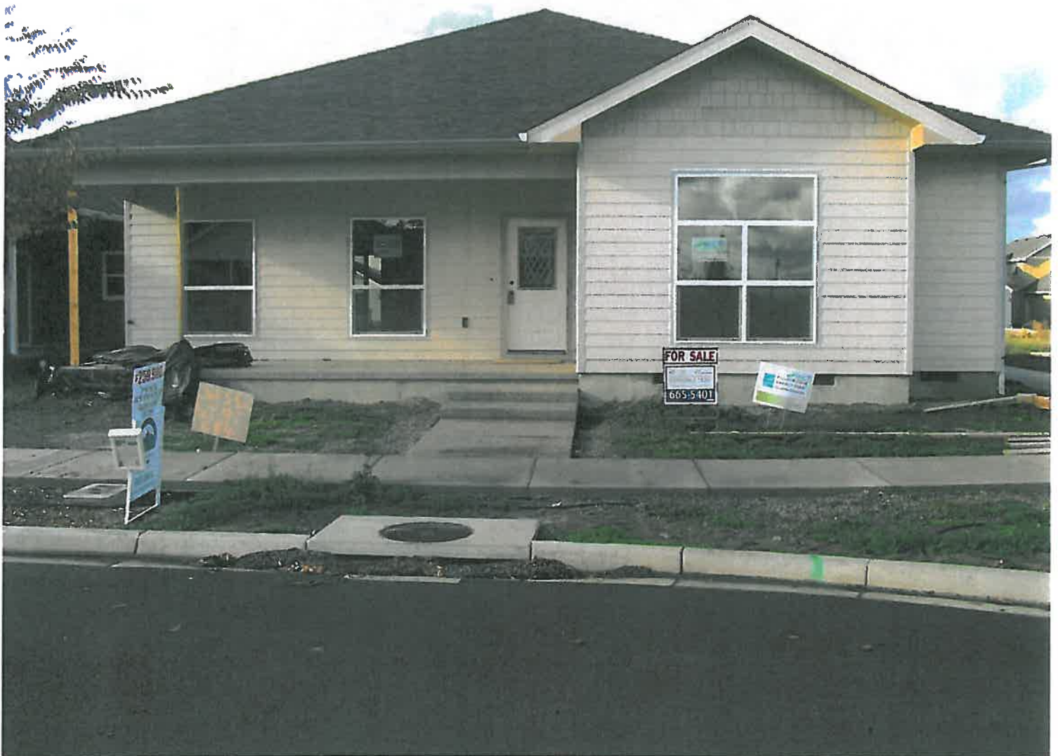
Front View 11-10-10