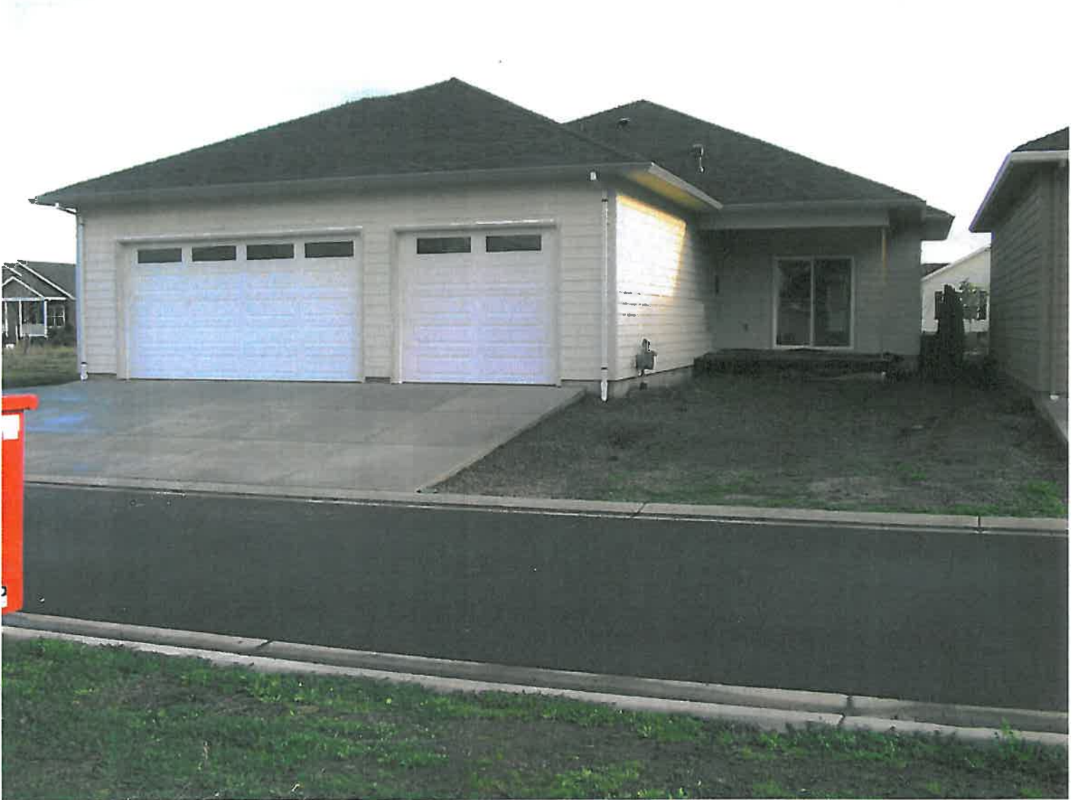
Rear View 11-10-10

If submitting more photographs than will fit on the preceding page, affix the additional photographs below. Identify all photographs with: date taken; "Front View" and "Rear View"; and, if required, "Right Side View" and "Left Side View."