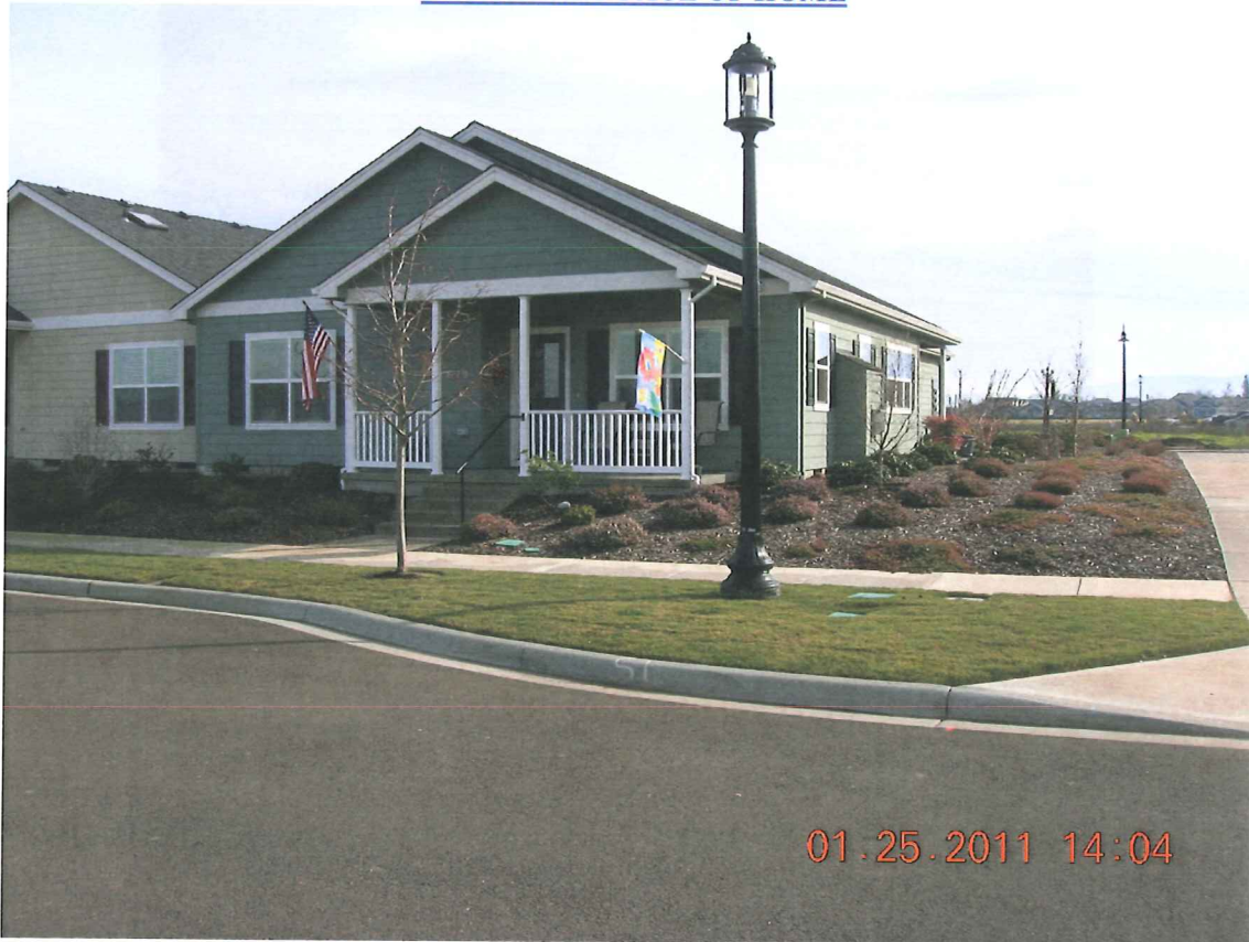
NORTHERLY FACE OF HOME

If using the Elevation Certificate to obtain NFIP flood insurance, affix at least two building photographs below according to the instructions for Item A6. Identify all photographs with: date taken; "Front View" and "Rear View"; and, if required, "Right Side View" and "Left Side View." If submitting more photographs than will fit on this page, use the Continuation Page, following.