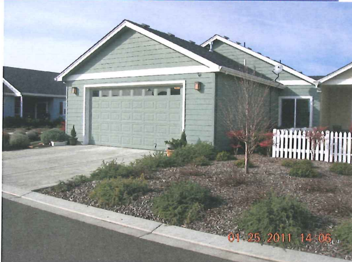
SOUTHERLY FACE OF HOME (LOOKING WESTERLY)