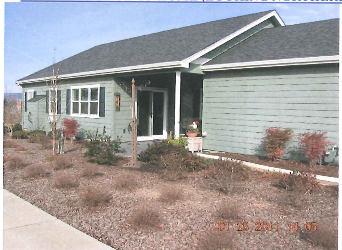
WESTERLY FACE OF HOME (LOOKING NORTHERLY)