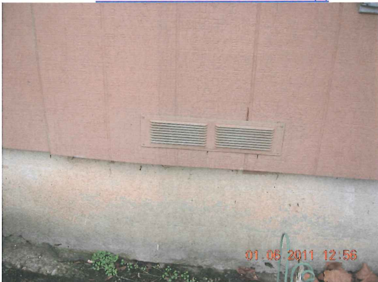
LOUVERED FOUNDATION VENT (5)