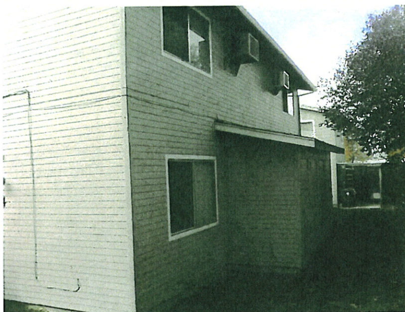
REAR VIEW: 113 GLENN WAY (11/10/08)