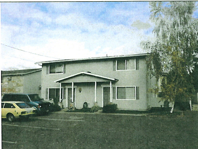
FRONT VIEW: 113 GLENN WAY (11/10/08)

If using the Elevation Certificate to obtain NFIP flood insurance, affix at least two building photographs below according to the instructions for Item A6. Identify all photographs with: date taken; "Front View" and "Rear View"; and, if required, "Right Side View" and "Left Side View." If submitting more photographs than will fit on this page, use the Continuation Page, following.