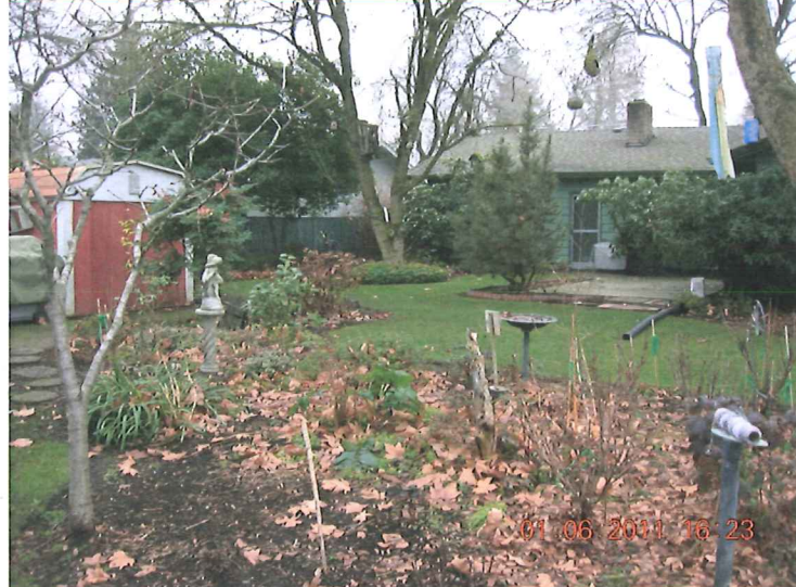
EASTERLY FACE OF HOME (LOOKING SOUTHWESTERLY)