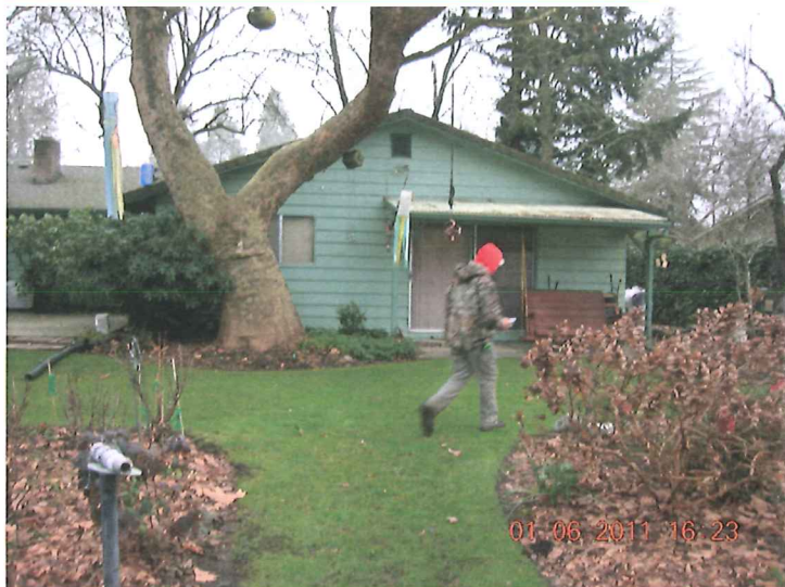
EASTERLY FACE OF HOME (LOOKING WESTERLY)