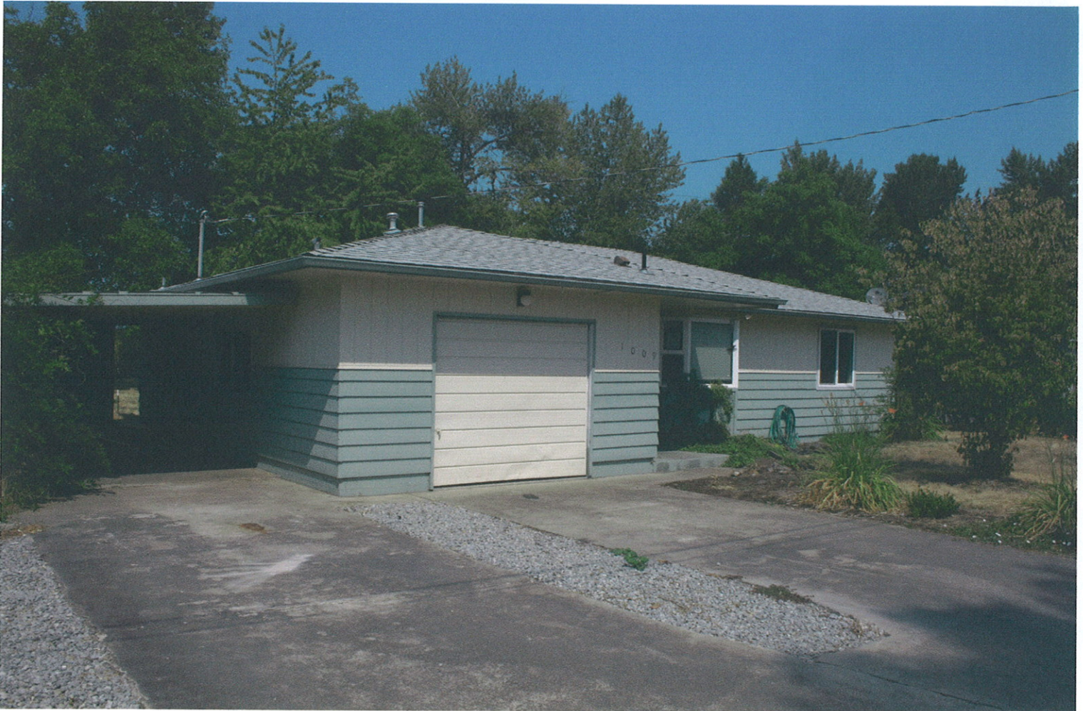
FRONT VIEW FROM COMET STREET. GPS CP#1 IN CENTER OF LEFT DRIVEWAY, 10 FEET SE OF GARAGE. 7-21-08

If using the Elevation Certificate to obtain NFIP flood insurance, affix at least two building photographs below according to the instructions for Item A6. Identify all photographs with: date taken; "Front View" and "Rear View"; and, if required, "Right Side View" and "Left Side View." If submitting more photographs than will fit on this page, use the Continuation Page, following.