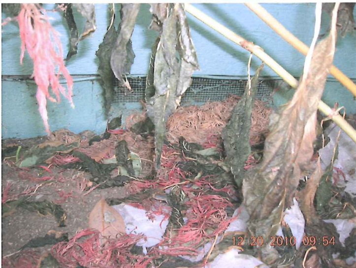
TYPICAL FOUNDATION VENT