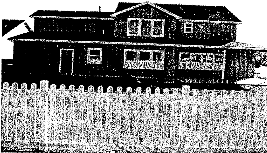
10/11/2006 BACK OF HOUSE (LOOKING EAST)