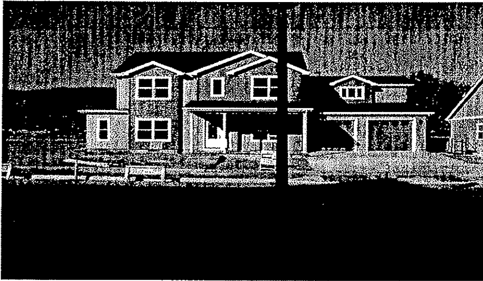
10/11/06 FRONT OF HOUSE (LOOKING WEST)