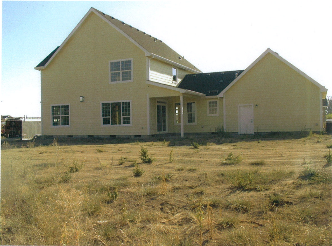
08/28/2006 REAR VIEW