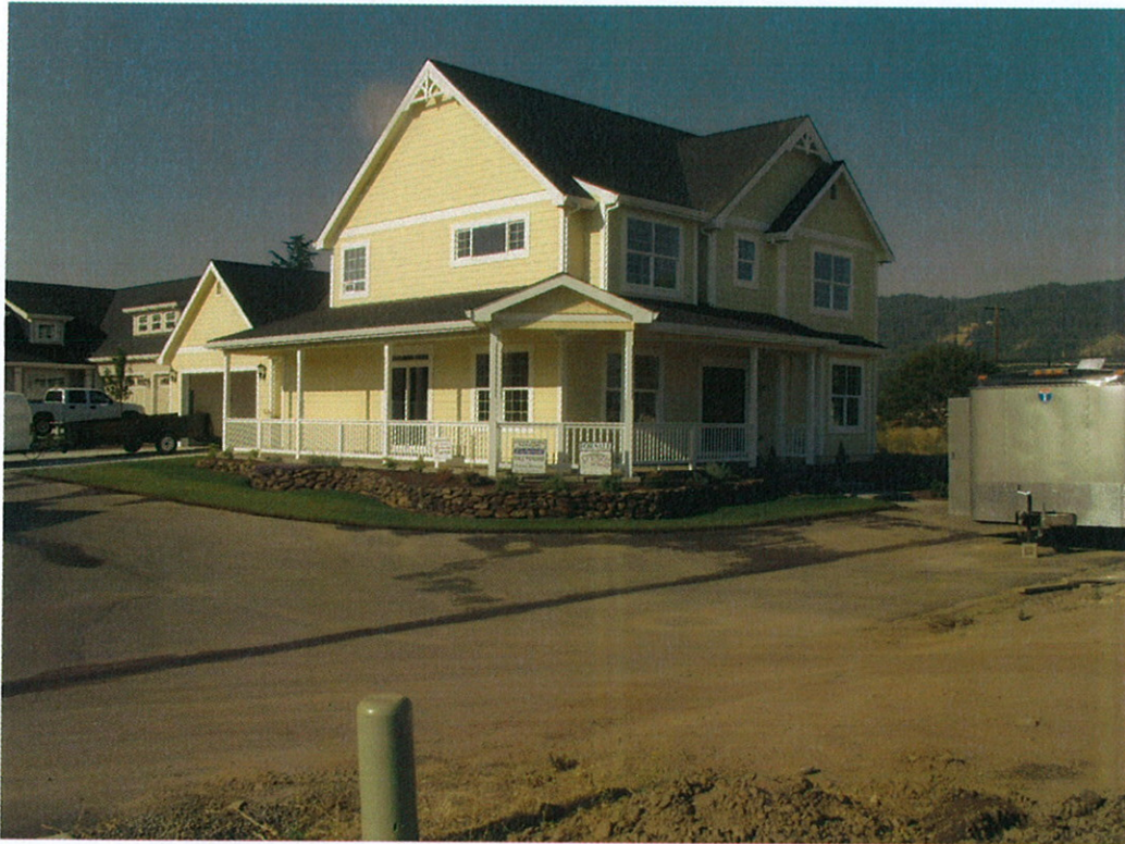
08/28/2006 FRONT & SIDE VIEW

If using the Elevation Certificate to obtain NFIP flood insurance, affix at least two building photographs below according to the instructions for Item A6. Identify all photographs with: date taken; "Front View" and "Rear View"; and, if required, "Right Side View" and "Left Side View." If submitting more photographs than will fit on this page, use the Continuation Page, following.