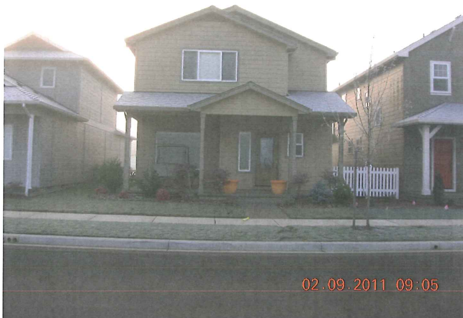
SOUTHERLY FACE OF HOME