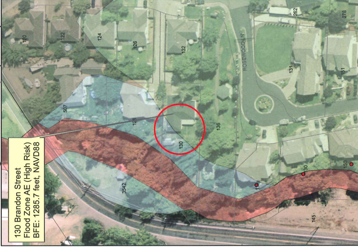
Pending Flood Map (2011)