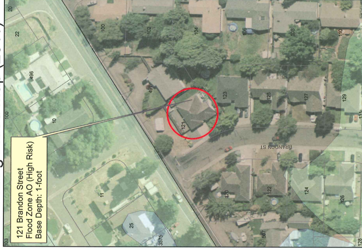
Pending Flood Map (2011)