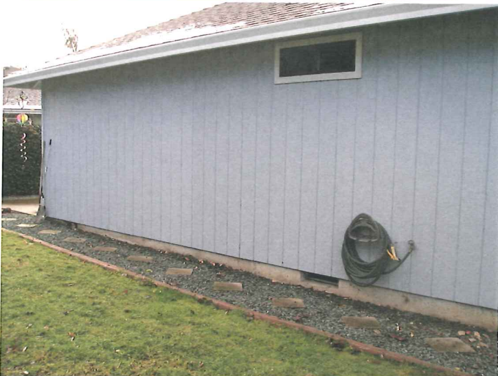
EASTERLY FACE OF HOME (LOOKING SOUTHERLY)