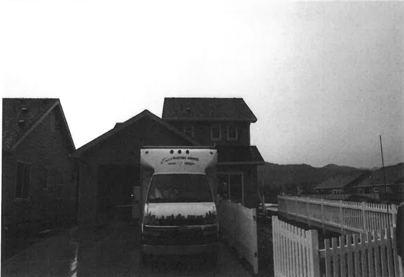
Rear view 12/10/2015

If submitting more photographs than will fit on the preceding page, affix the additional photographs below. Identify all photographs with: date taken; "Front View" and "Rear View"; and, if required, "Right Side View" and "Left Side View." When applicable, photographs must show the foundation with representative examples of the flood openings or vents, as indicated in Section A8.