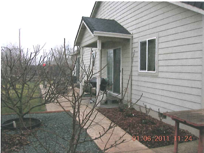
SOUTH FACE OF HOME (LOOKING WESTERLY)